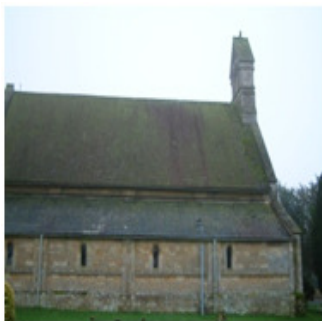
The Old Roof