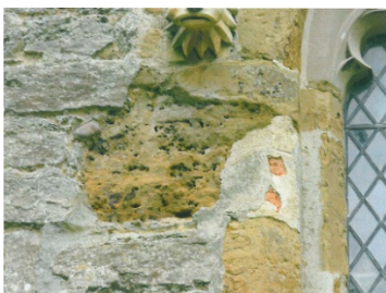
Extensive damage by masonry bees