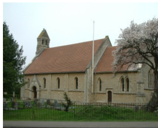
The New Roof