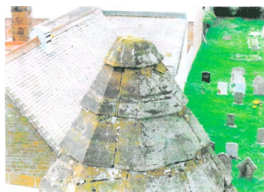
Severe erosion to stair turret