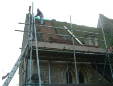
Removing the old tiles