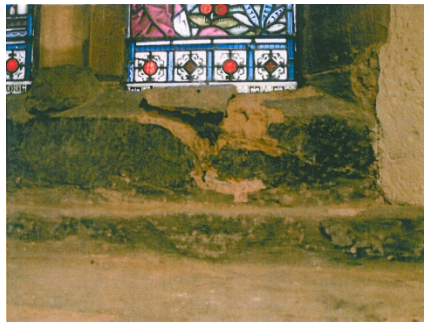
East window, damaged stonework