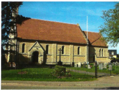
St John the Baptist, Hartwell (£3,000)