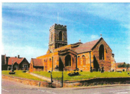
St Mary the Virgin, Little Houghton (£5000)