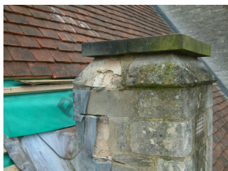
The boiler chimney in need of repair