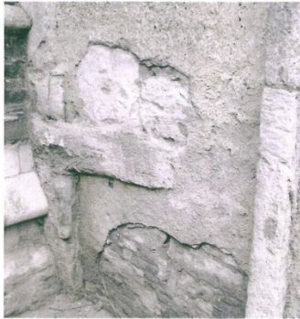
Tower base, failed rendering