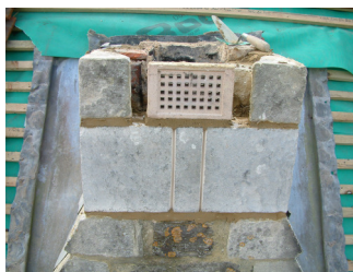
The boiler chimney being repaired