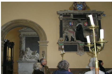
Viewing the memorials at Stoke Doyle.