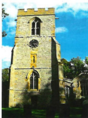
All Saints, Yelvertoft (£3,500)