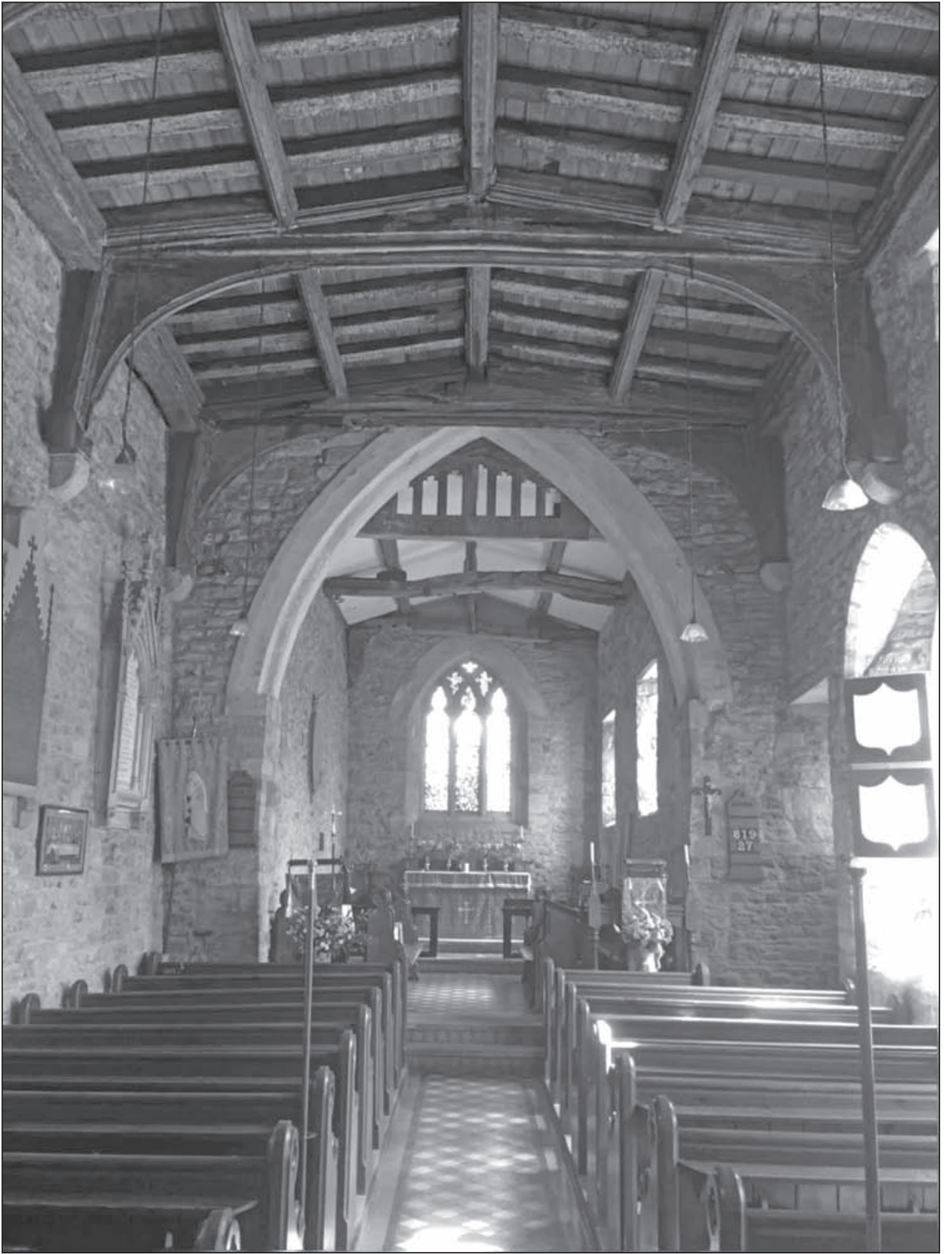
St Denys, Cold Ashby