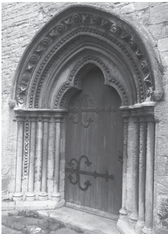
St Mary, Warmington

Historic Churches Support Officer, Diocese of Peterborough