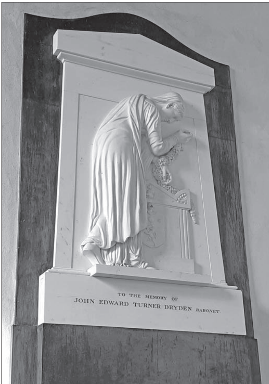
St Mary, Canons Ashby

As a result, the DAC has to reconcile what may be the conflicting demands for the conservation of the building and the pastoral needs of the Church; not an easy task.