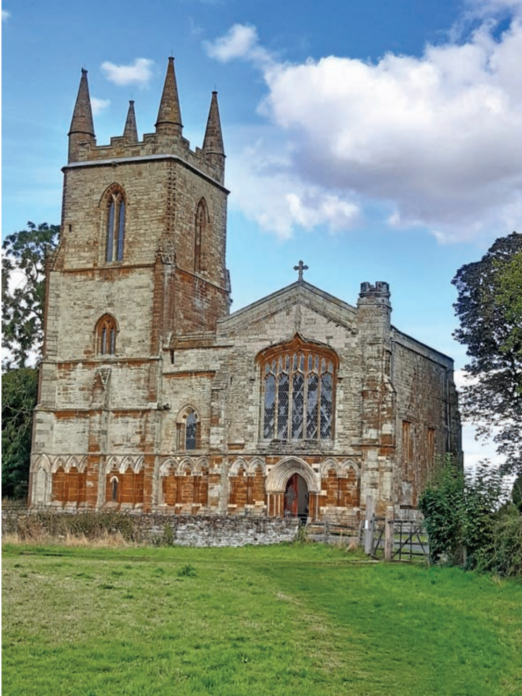
St Mary, Canons Ashby

With thanks to all those who provided articles and photographs for this Report.