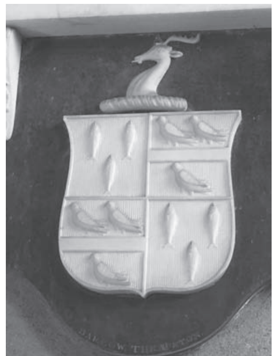
All Saints, Barnwell