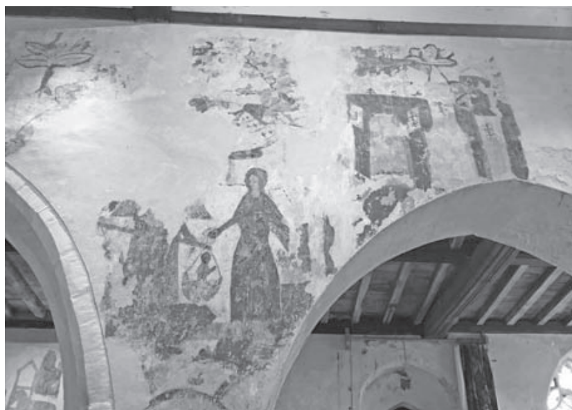
St Botolph, Slapton

our churches, with dwindling congregations and diminishing finances. He said he was in awe of what many very small congregations and communities achieved, and he realised how vital a lifeline the Northamptonshire Historic Churches Trust provided. He did not want our churches to survive just as historic monuments, but rather as places with a unique life and purpose – sources of connection with the past and solace for