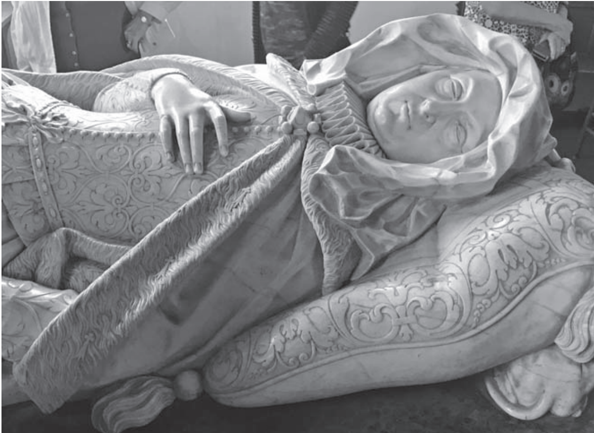
St Michael, Church Stowe