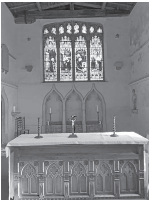
St Mary, Wappenham