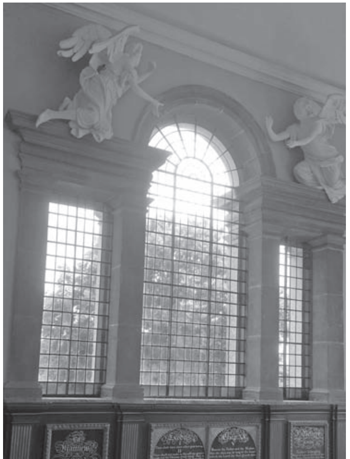
St Rumbald, Stoke Doyle