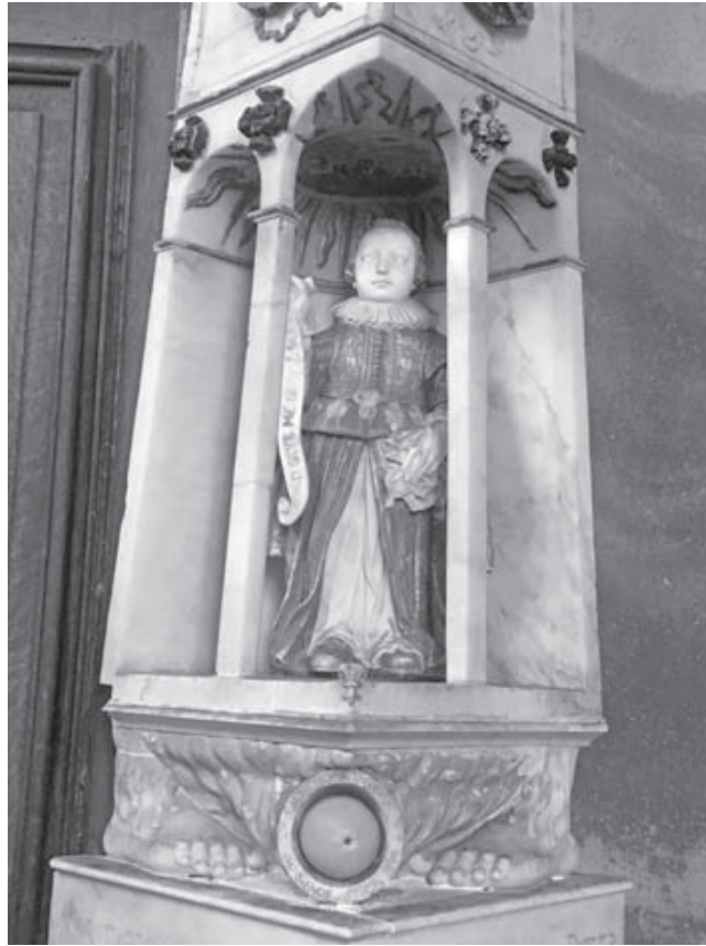
All Saints, Barnwell